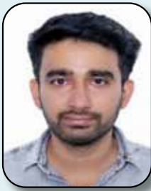
Programme Batch Co-ordinator

She was also associated in the preparation of a synthesis document entitled Different Approaches for Achieving EFA: Indian Experience published jointly by UNESCO, New Delhi and National Institute of Educational Planning and Administration (NIEPA), New Delhi, 2003. She played a significant role in the publication of state reports and thematic papers for the National Evaluation of Operation Blackboard in 2007. She has authored two books in the history of education entitled Genesis and Growth of University Education in India and Development of University Education. She has authored and co-authored several articles related to history of education, teacher education and disadvantaged groups. She has co-authored Practical Tips for Teaching Multigrade Classes for the series on Embracing Diversity: Toolkit for Creating Inclusive, Learning-Friendly Environments Specialized Booklet 4 published by UNESCO Bangkok, 2013.