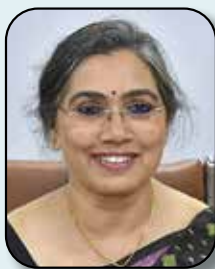
Programme Batch Co-ordinator